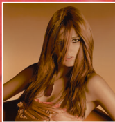
Latin Diva 01