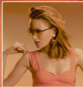
Riviera Siren 01