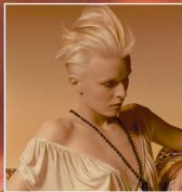
Morocco Muse 01