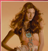
Latin Diva 02