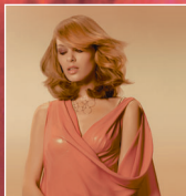
Riviera Siren 02